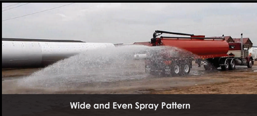
Wide and Even Spray Pattern