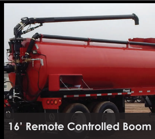
16' Remote Controlled Boom