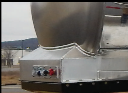
Electrical and Gladhand Hookups