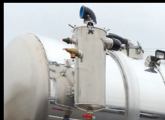
14 Gallon Secondary