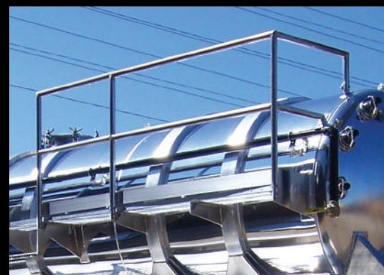
OSHA Catwalk and Guardrail