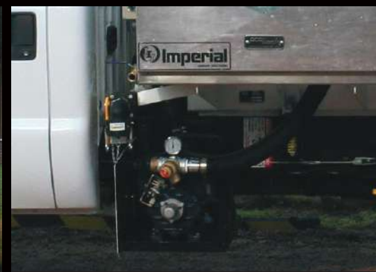
HXL4V Vacuum Pump