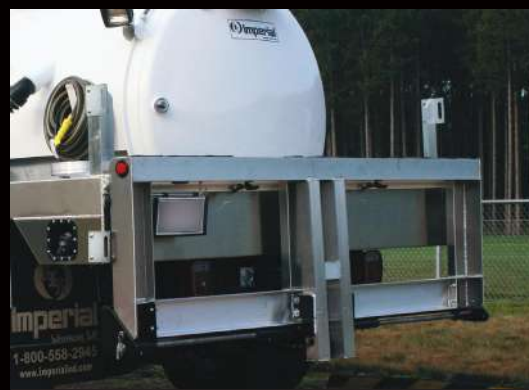
Potty Gate Restroom Carrier