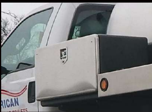
pol-E-vent Tool Box