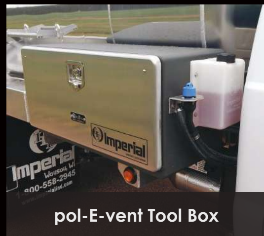
pol-E-vent Tool Box