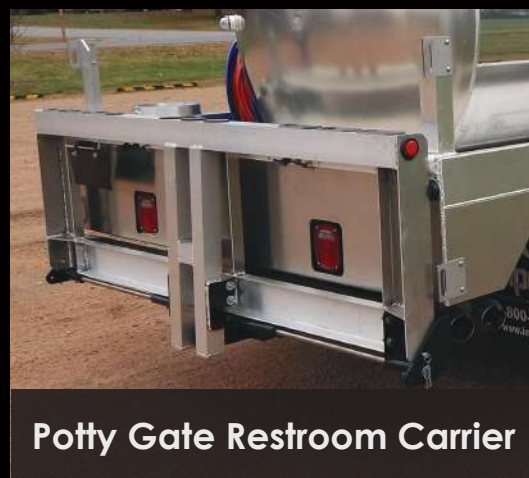
Potty Gate Restroom Carrier