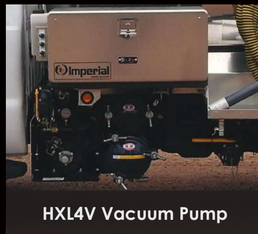
HXL4V Vacuum Pump