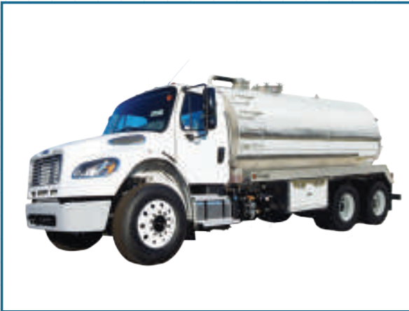
2019 FREIGHTLINER M2-106

CUMMINS ENGINE NVE607-FAN-COOLED 380 CFM PUMP