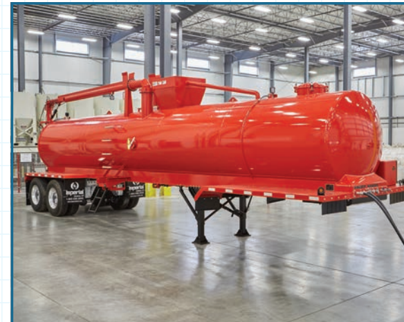
MRK 6500AG SERIES