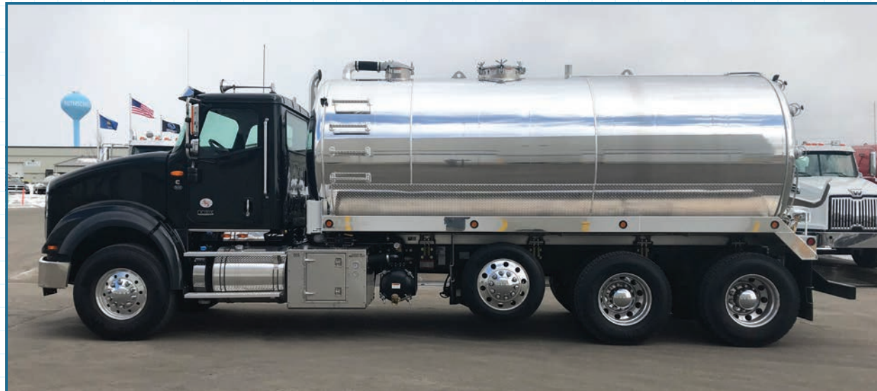
2019 INTERNATIONAL HX