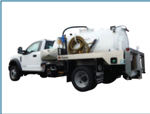
2018 FORD F550 4X2

DIESEL OR GAS ENGINE MASPORT HXL4 160CFM PUMP