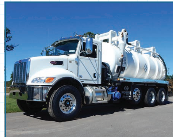
DOT 407/412 CODE TANK

Insulated trailer • Full-length OSHA catwalk and guard rail