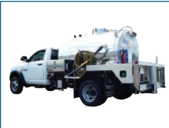
2018 RAM 5500 4X2

350HP CUMMINS ENGINE NVE607 FAN-COOLED 380 CFM PUMP