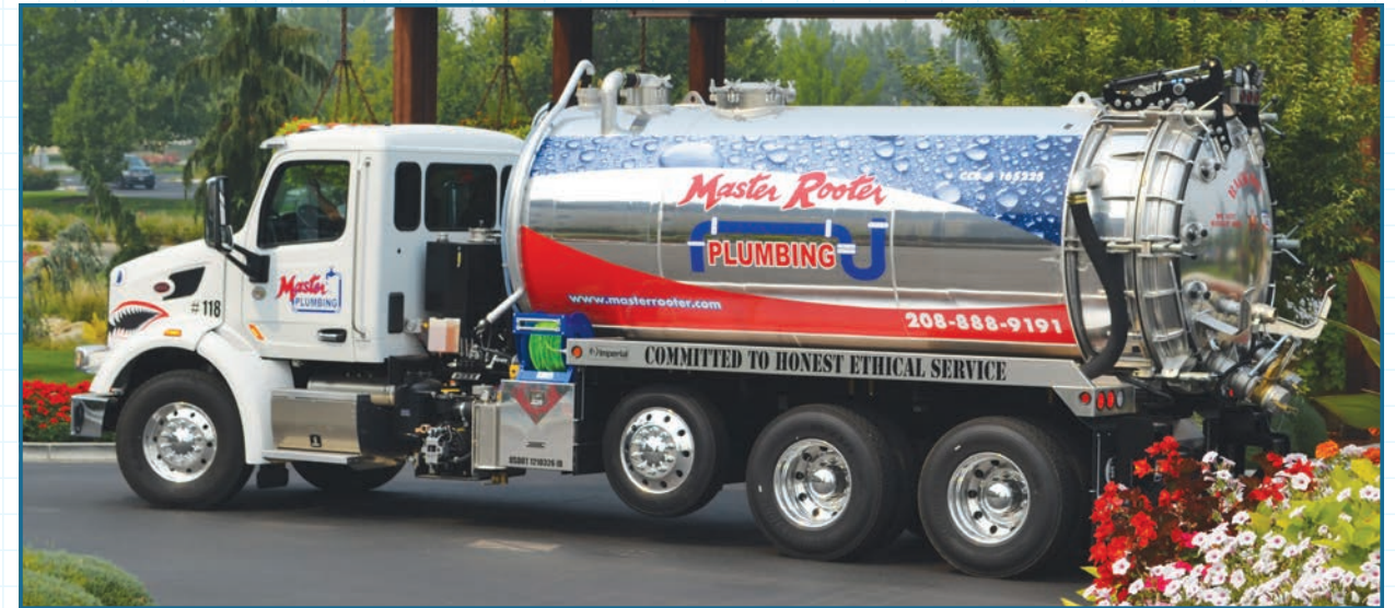
2017 PETERBILT 567