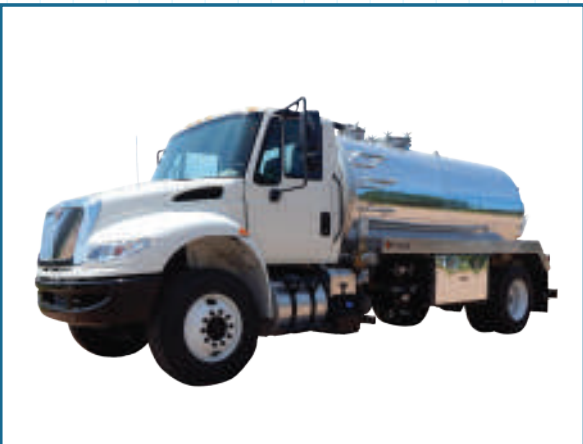
2019 INTERNATIONAL 4300 SBA