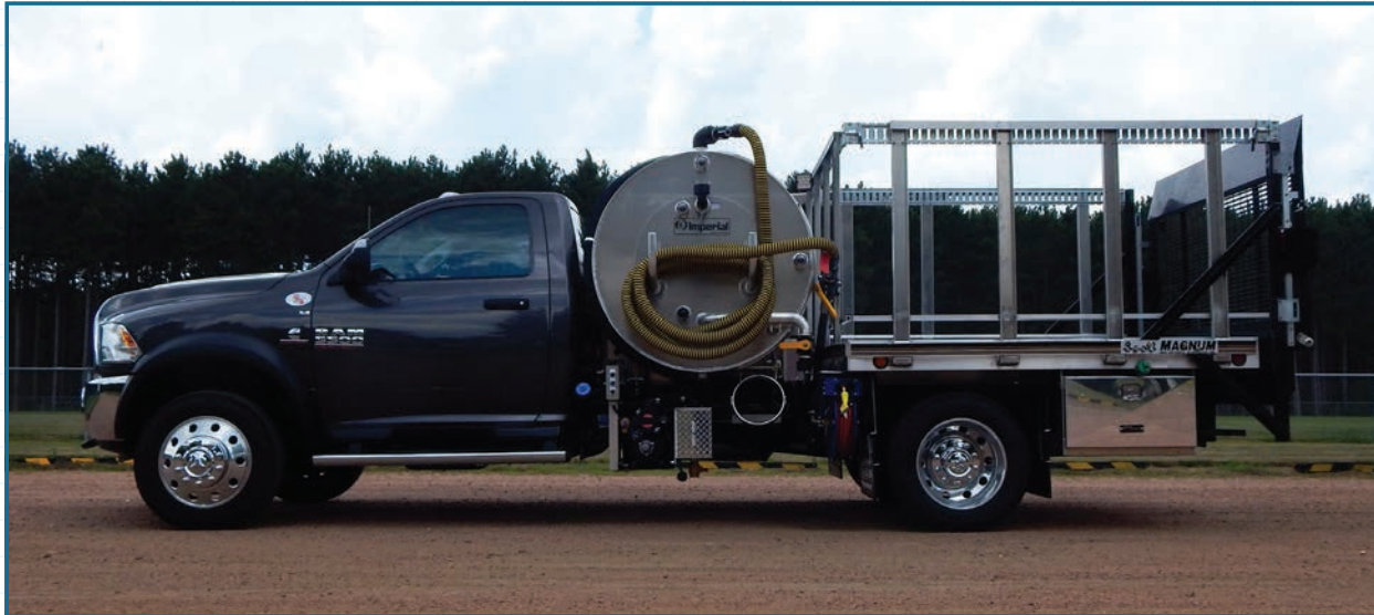
SIDEWINDER ON 4X4 RAM