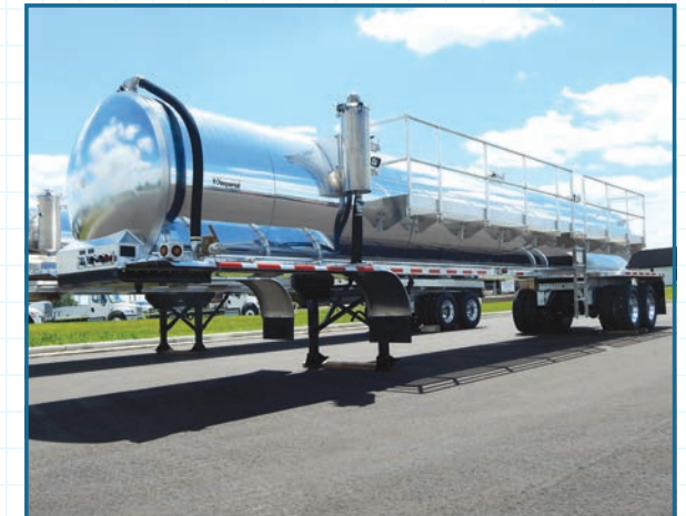
MRK 6800 SERIES

American-made • Boom kit Galvanized sub frame • ALCOA wheels Interior & exterior contentious welds