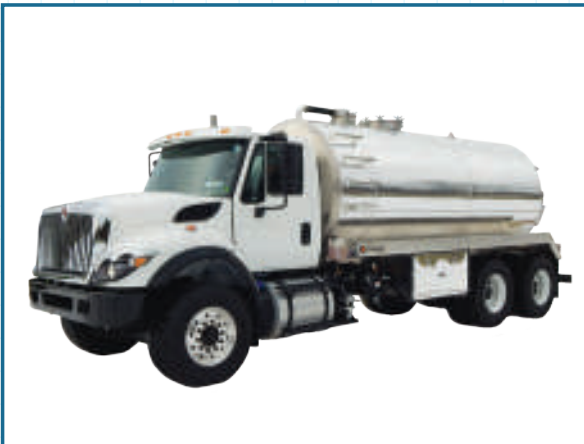
2019 INTERNATIONAL 7500 SBA

CUMMINS ENGINE NVE607-FAN-COOLED 380 CFM PUMP