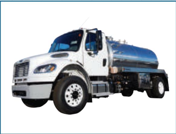
2019 FREIGHTLINER M2-106

DIESEL OR GAS ENGINE MASPORT HXL4 160CFM PUMP