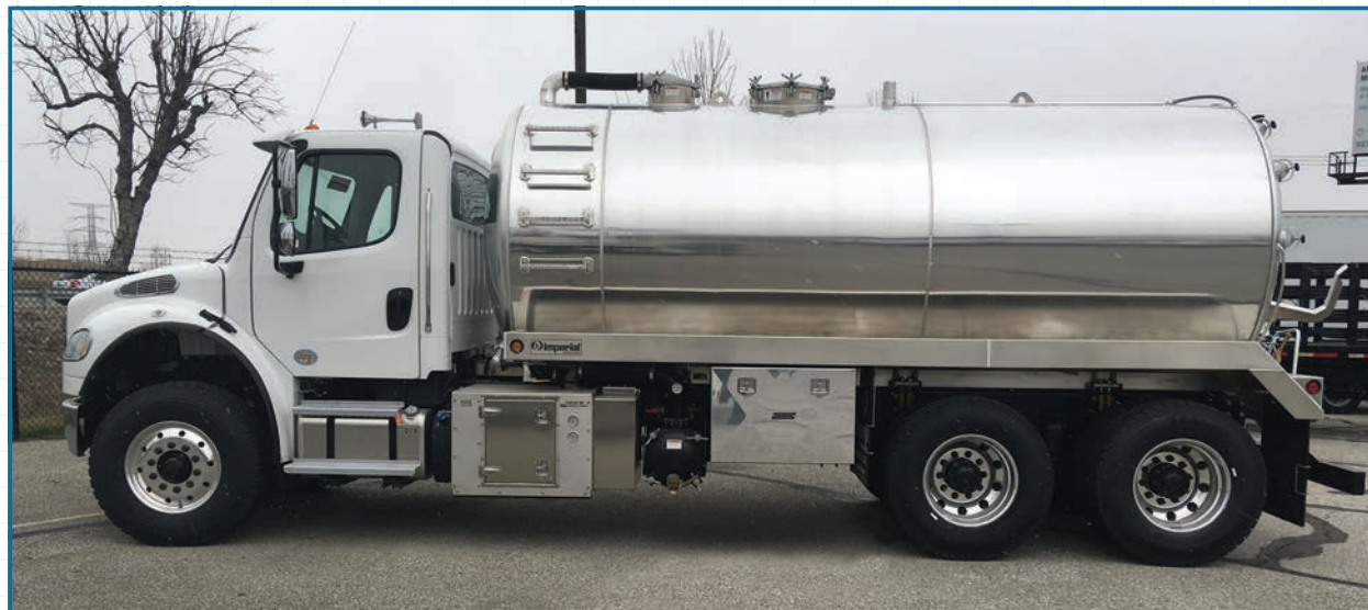
2018 FREIGHTLINER M2-106

505 HP CUMMINS ENGINE • ALLISON AUTOMATIC • FULL LOCKERS • 20000 FRONT, 46 REARS