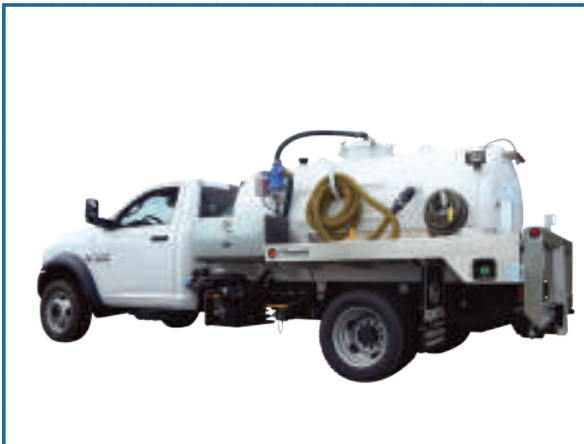
2018 RAM 5500 4X2

DIESEL OR GAS ENGINE MASPORT HXL4 160CFM PUMP