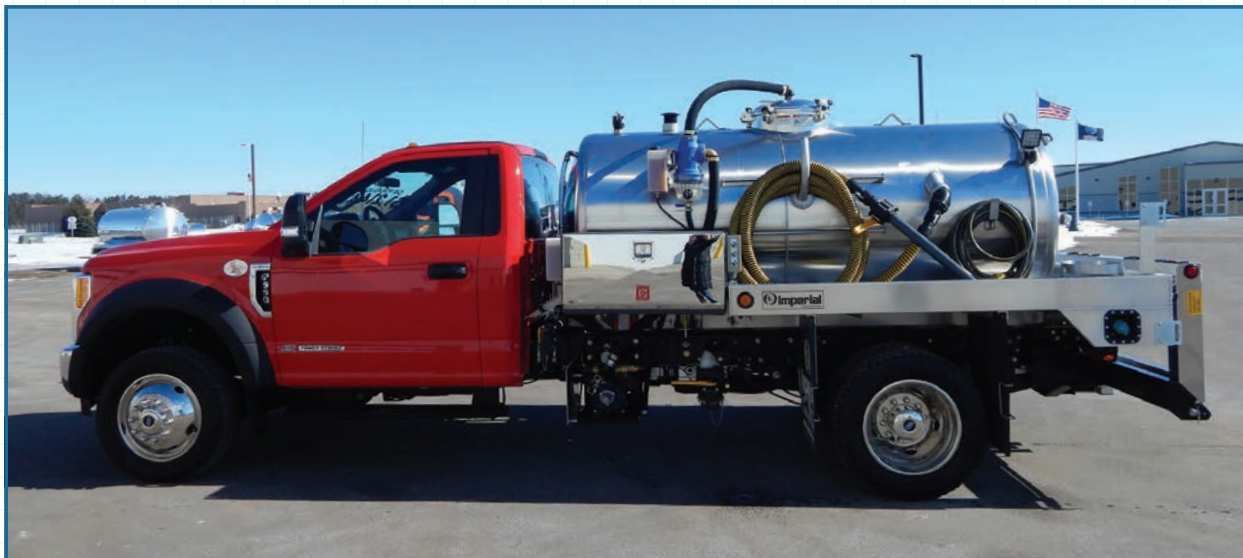
2017 FORD F550 4X2

8' ALUMINUM FLAT BED • LIFT GATE • MAPORT HXL4